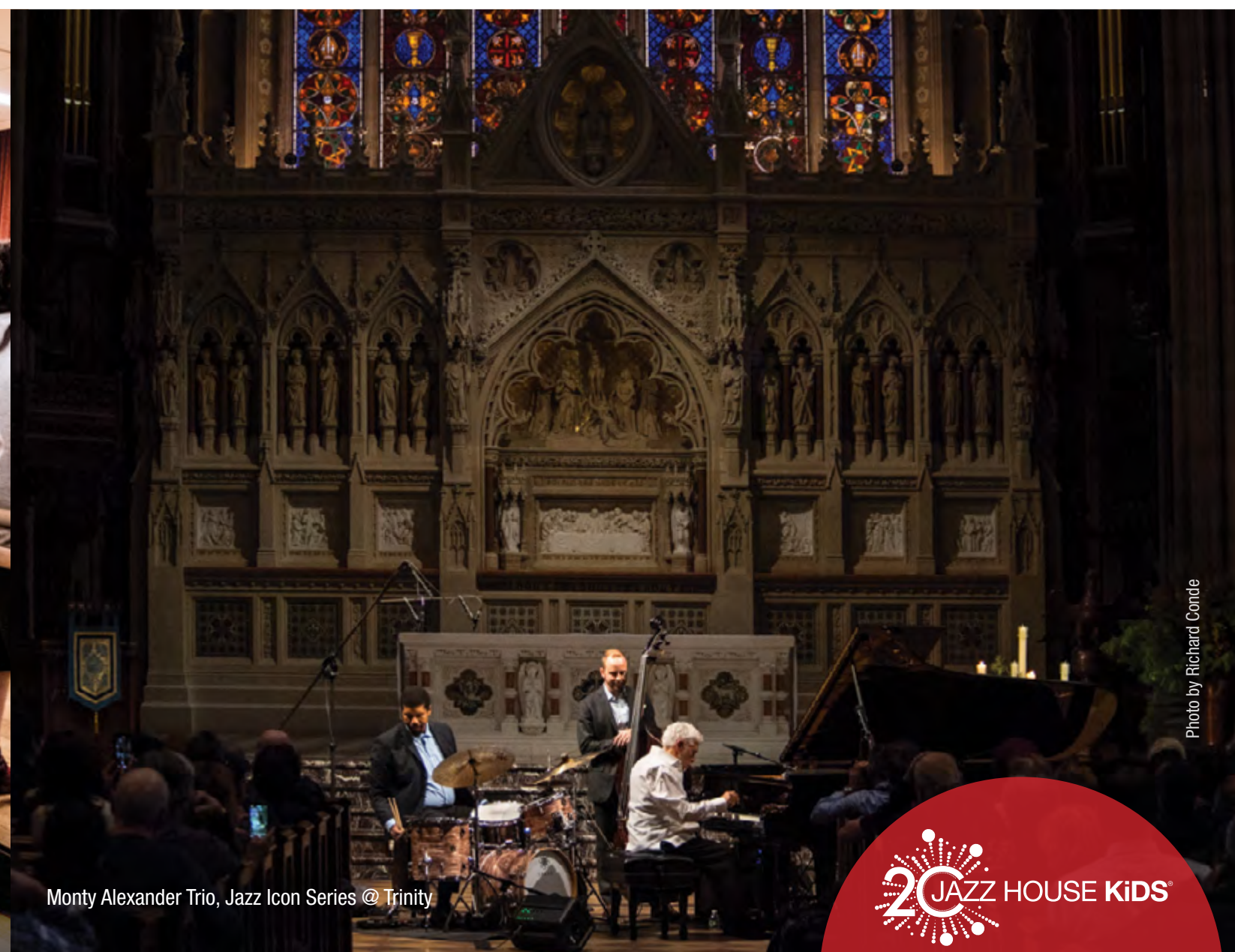
Monty Alexander Trio, Jazz Icon Series @ Trinity