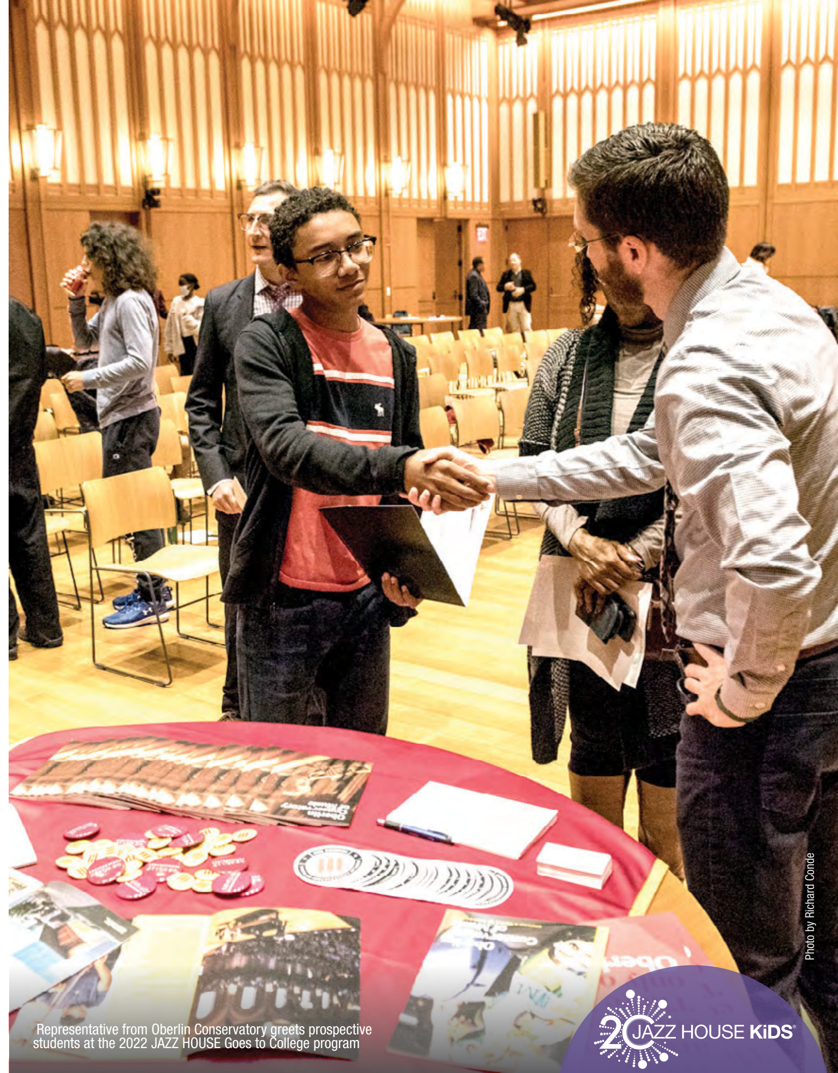
Representative from Oberlin Conservatory greets prospective students at the 2022 JAZZ HOUSE Goes to College program